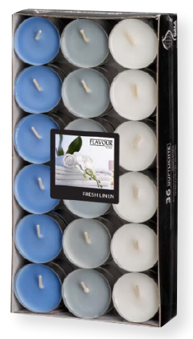
Scented Lights, tone in tone in Alu-Cup pack of 36 approx. Ø 4/2 cm art.-no. 030 685 🌮 8 packs 🔊 720