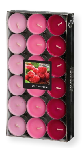
Scented Lights, tone in tone in Alu-Cup pack of 36 approx. Ø 4/2 cm art.-no. 030 685 🌮 8 packs 🔊 720