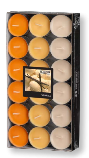
Scented Lights, tone in tone in Alu-Cup pack of 36 approx. Ø 4/2 cm art.-no. 030 685 資 8 packs 🏹 720