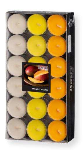
Scented Lights, tone in tone in Alu-Cup pack of 36 approx. Ø 4/2 cm art.-no. 030 685 資 8 packs 🏹 720