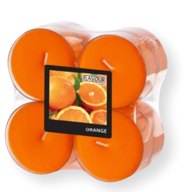
Scented Maxi Lights in PC-Cup pack of 8 approx. Ø 6/3 cm art.-no. 030 267 To packs 900