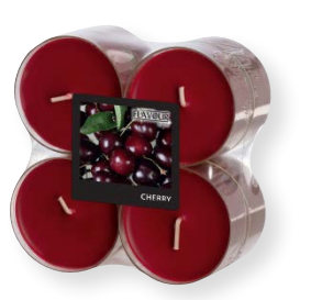
Scented Maxi Lights in PC-Cup pack of 8 approx. Ø 6/3 cm art.-no. 030 267 % 6 packs % 900