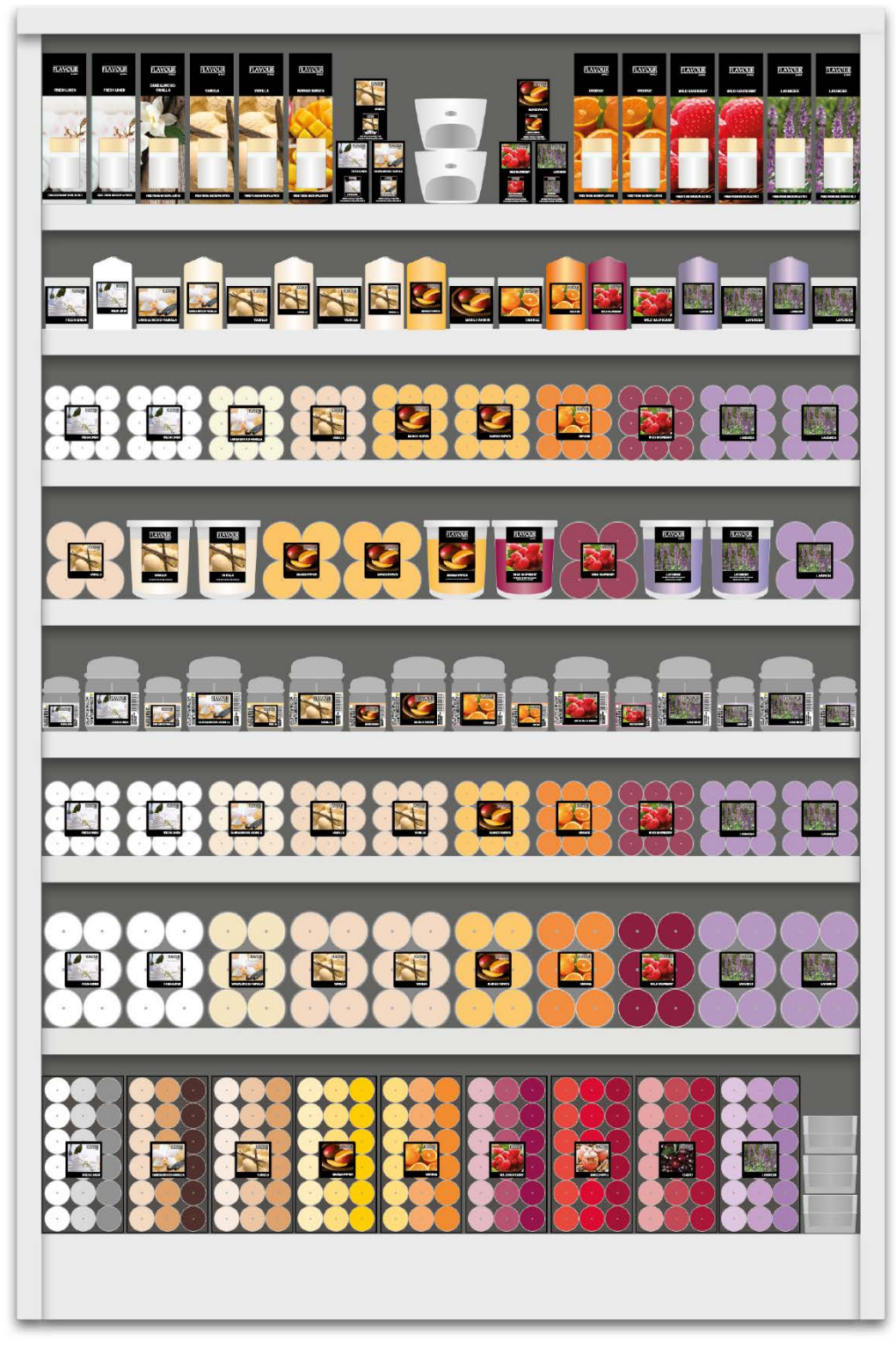
Placement Example 1 × 1,25 m GALA FLAVOUR

Research shows that 90% of candles are bought on impulse, this is why product presentation is of premium importance. Shelves should be clearly structured and inviting to positively influence consumers. The psychology of purchase decision making should influence product placement on the shelves to optimize