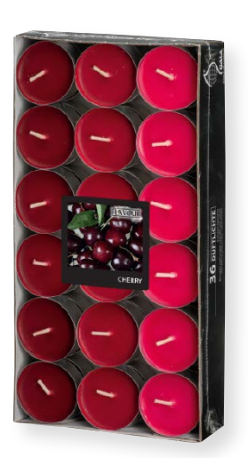
Scented Lights, tone in tone in Alu-Cup pack of 36 approx. Ø 4/2 cm art.-no. 030 685 % 8 packs % 720