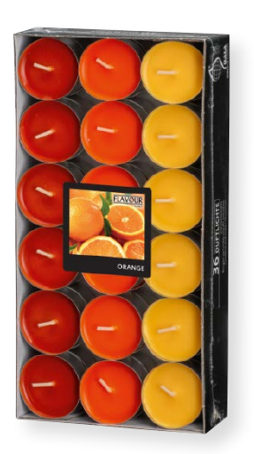
Scented Lights, tone in tone in Alu-Cup pack of 36 approx. Ø 4/2 cm art.-no. 030 685 T20